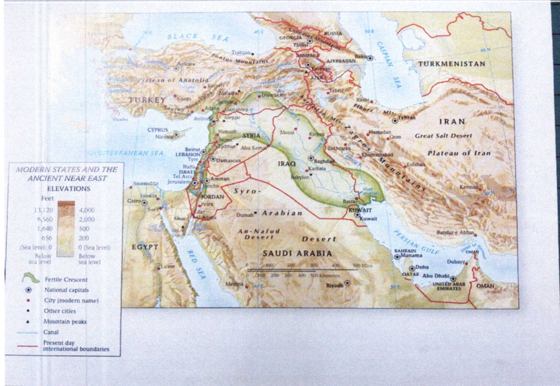
Maps 1 and 2